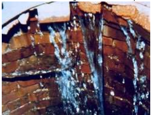
Figure 1. Storm water entering into the sewer system from a manhole, at left, and from a defect inside a pipe, at right.

This situation is called infiltration & inflow (I&I) and is the process of storm water runoff getting into the sanitary sewer system.