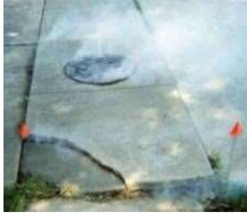
Figure 2. capacity blowers are used to pump non-toxic smoke into a manhole (left photo). In the right photo, smoke is pushed into the system and emerges from cracks in the sidewalk and at a downstream manhole.

Smoke testing is the process of injecting artificially produced smoke into a blocked off pipeline segment to see where the smoke emerges. If the sewer is in good condition then the forced smoke will emerge from manhole lids along the line and house vents on the roof. If the line has defects, the smoke will find the break and try to escape through the break.